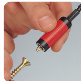
adjusts automatically to head of screw