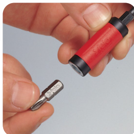
fits all C 6,3 x 25 mm bits

Only one hand needed for operation – your other hand is free for positioning the workpiece or securing your hold.